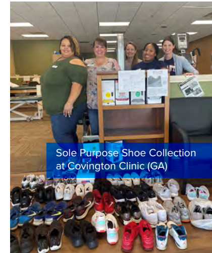
Sole Purpose Shoe Collection at Covington Clinic (GA)