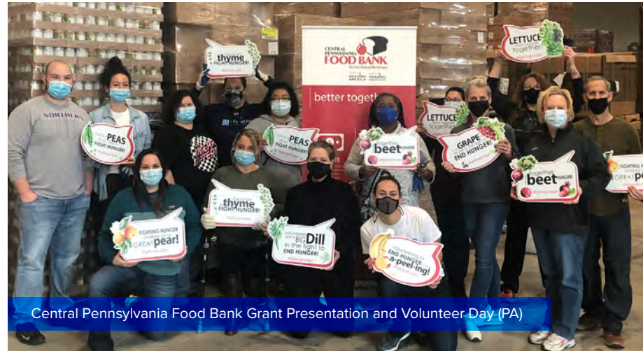
Central Pennsylvania Food Bank Grant Presentation and Volunteer Day (PA)