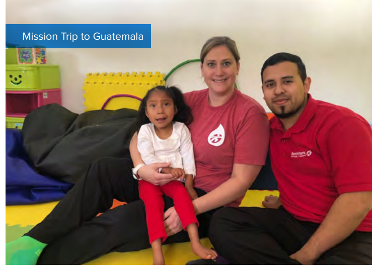
Mission Trip to Guatemala