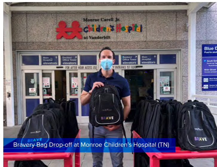
Bravery Bag Drop-off at Monroe Children's Hospital (TN)