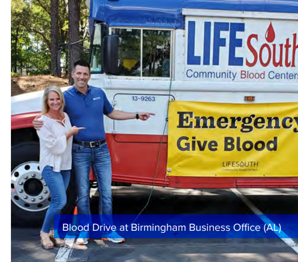
Blood Drive at Birmingham Business Office (AL)